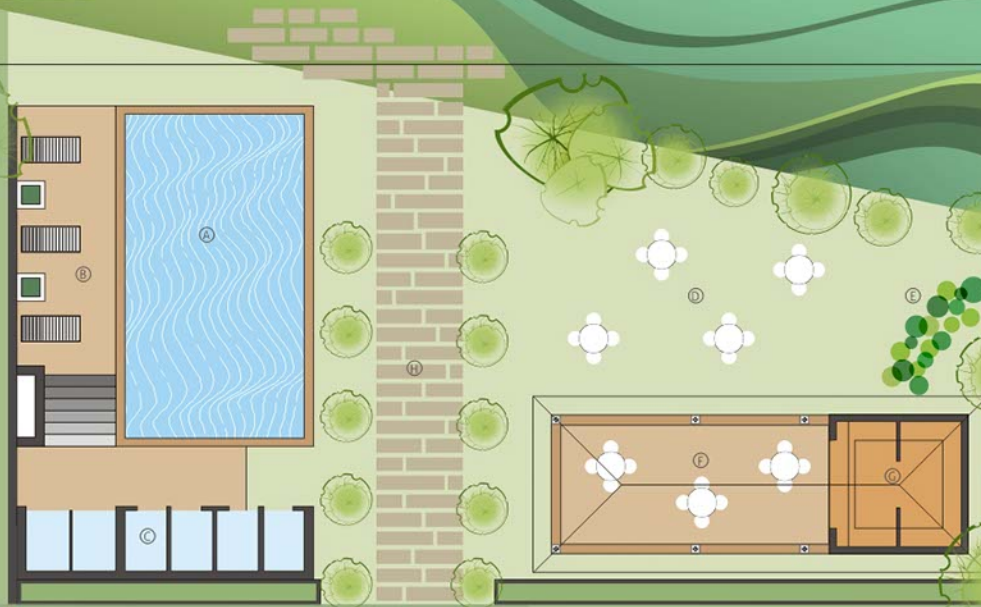
Infinity pool & lounge / restaurant